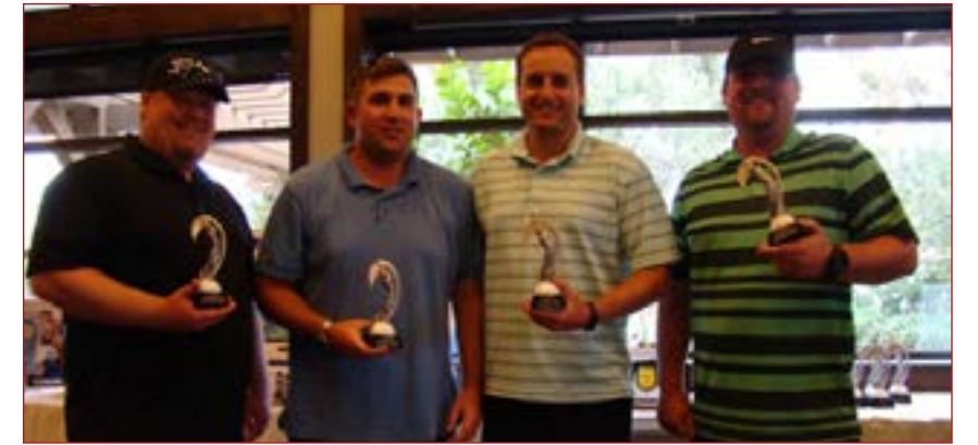
HARDWARE – Some the trophy-winners from a past KofC tournament.